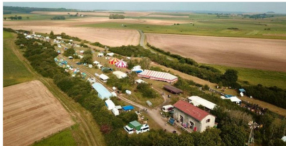
A bird's eye view of la gare during les Rayonnantes (Août 2021)