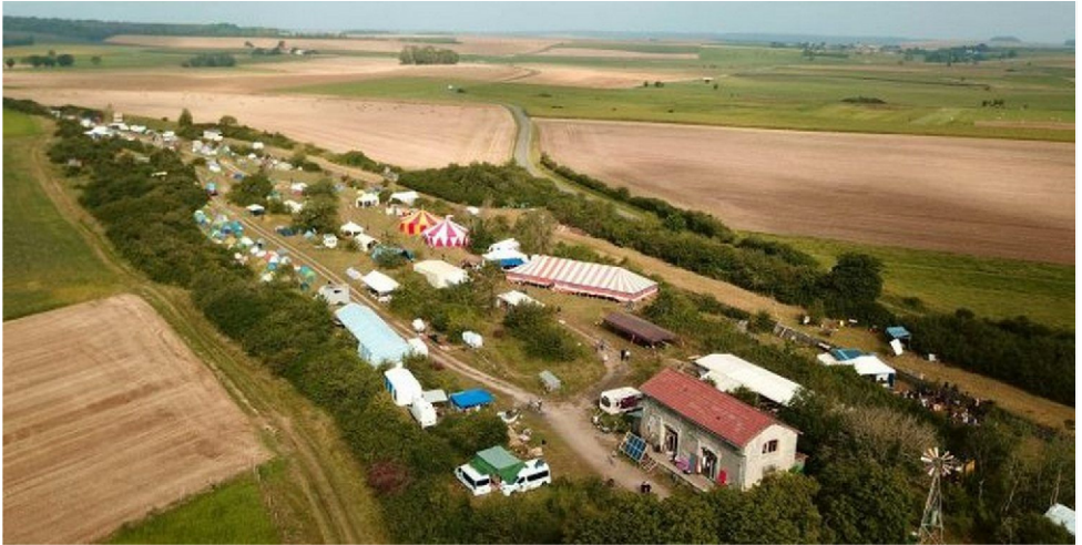
A bird's eye view of la gare during les Rayonnantes (Août 2021)